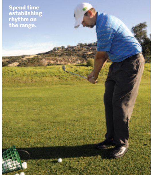
Spend time establishing rhythm on the range.