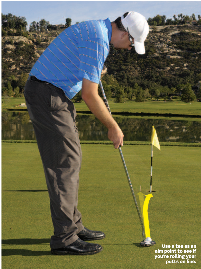
Use a tee as an aim point to see if you're rolling your putts on line.