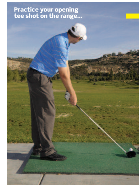
Practice your opening tee shot on the range...

If there's no short-game area, I'll just work on the motion of the shots on the driving range or around the collar of the practice putting green (assuming chipping and pitching is allowed).